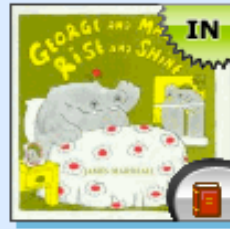
George and Martha rise and shine Marshall, James, 1942-1992. E MAR