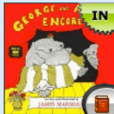
George and Martha encore Marshall, James, 1942-1992. E MAR