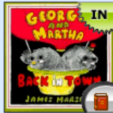
George and Martha back in town Marshall, James, 1942-1992. E MAR