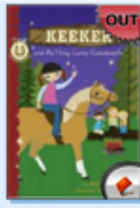
Keeker and the pony camp catastrophe Higginson, Hadley. F HIG Series: Sneaky pony series ; bk. 5