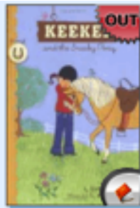
Keeker and the sneaky pony Higginson, Hadley. F HIG Series: Sneaky pony series ; bk. 1