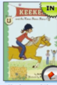
Keeker and the horse show show-off Higginson, Hadley. F HIG Series: Sneaky pony series ; bk. 2