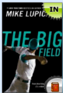
The big field Lupica, Mike. F LUP