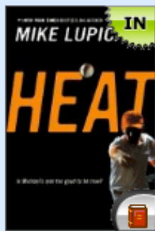
Heat Lupica, Mike. F LUP