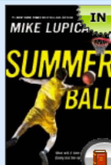
Summer ball Lupica, Mike. F LUP