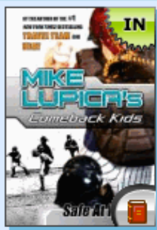
Safe at home Lupica, Mike. F LUP